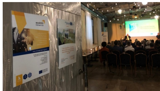
VPR presents ecoRIS3 Action Plan