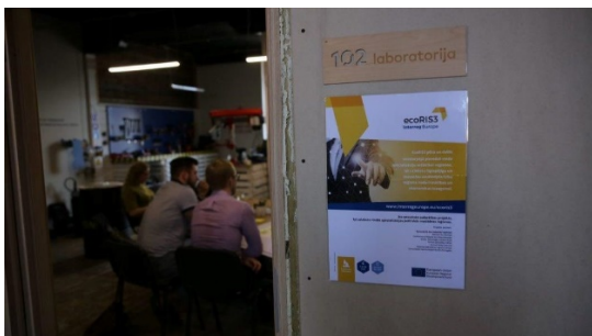
Innovation on the Menu in Vidzeme